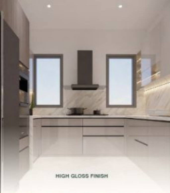
HIGH GLOSS FINISH