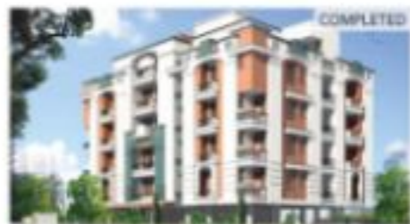
ARIHANT ENCLAVE, Ajmer Road