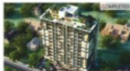
ROYAL FLORENCE, Narayan Vihar