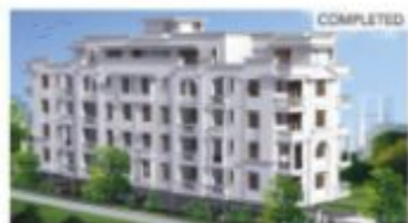
ARIHANT RESIDENCY, Ajmer Road