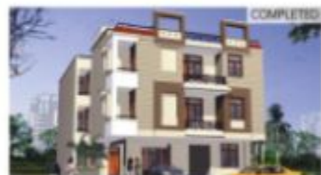
AASTHA APARTMENTS, Nirman Nagar