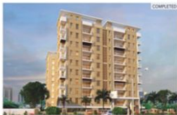
ROYAL REGALIA, Gandhi Path | RERA No. RAJ/P/2017/152