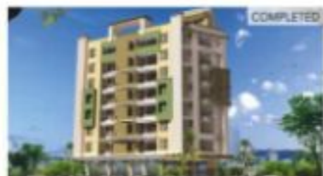
WESTERN HEIGHTS, Shyam Nagar