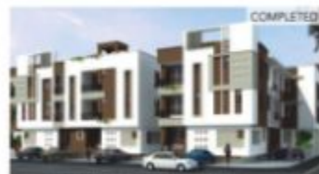
CLASSIC RESIDENCY, Vaishali Nagar