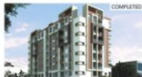
ROYAL CASTLE, Vaishali Nagar