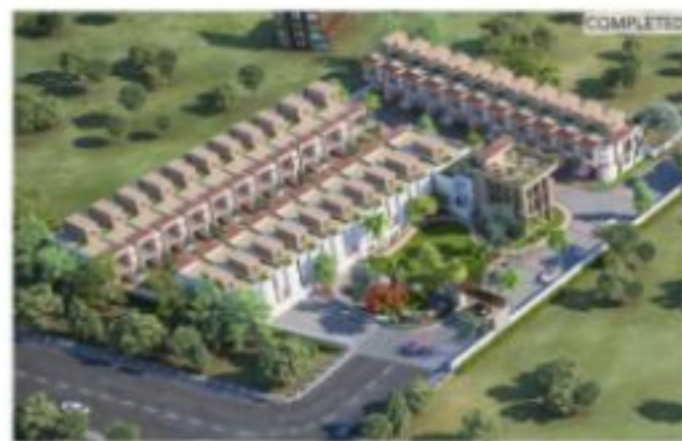
ROYAL EXOTICA, Gandhi Path | RERA No. RAJ/P/2019/1120