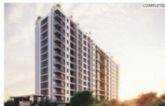
ROYAL GRAVITAZ, Gandhi Path | RERA No. RAJ/P/2020/1339