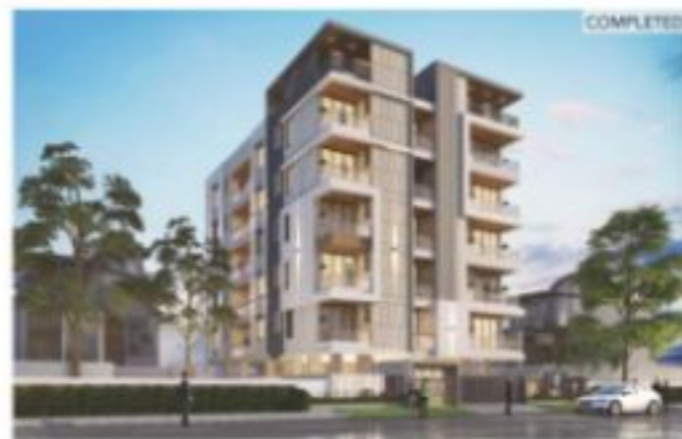
JANKI ROYALE, Bapu Nagar | RERA No. RAJ/P/2022/1949