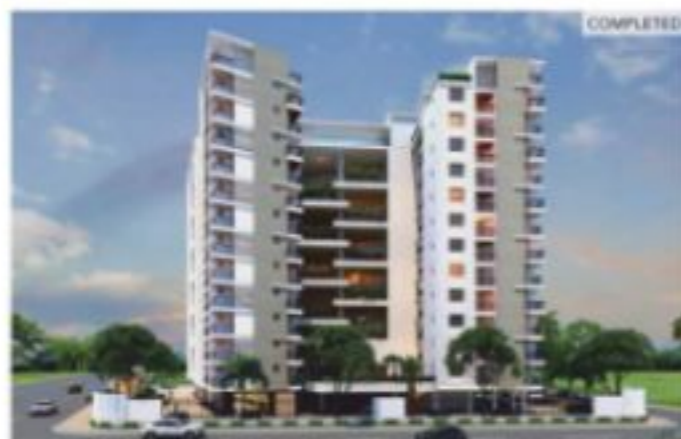
ROYAL ESSENCE, Gandhi Path | RERA No. RAJ/P/2017/136