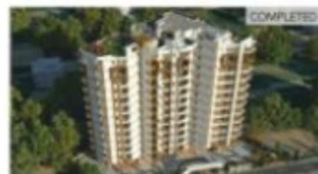
ROYAL TATVAM, Patrakar Colony