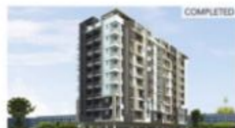
ROYAL AVENUE, Patrakar Colony