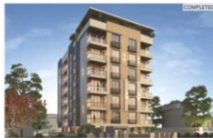
ROYAL GRACIA, Mahaveer Nagar | RERA No. RAJ/P/2022/1917