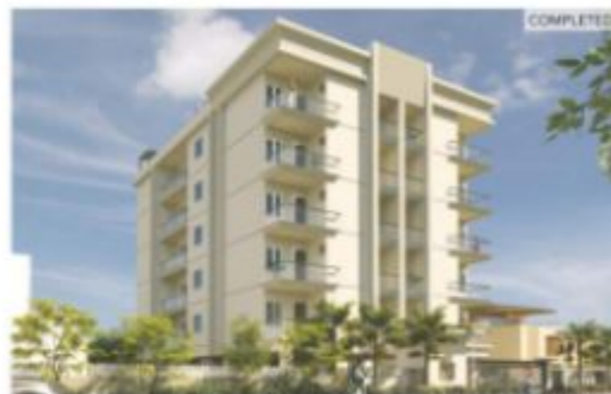
ROYAL EMINENCE, Tilak Nagar | RERA No. RAJ/P/2020/1352