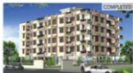
VARDHMAN APARTMENTS, Banipark

The group's top most priority is to create and develop properties for your comfortable living as it has a strong belief that the things that last for a lifetime are experiences and memories. Working up on this philosophy, it boasts to be the creator of some magnificent residential & commercial properties in Jaipur.