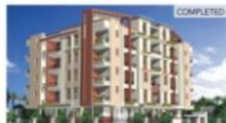
VARDHMAN RESIDENCY, Ajmer Road