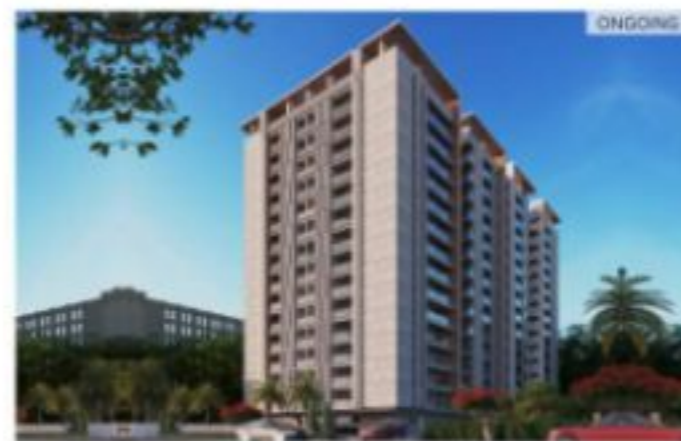
ROYAL ETERNIA, Gandhi Path | RERA No. RAJ/P/2023/2881

Images are for illustration purposes only.